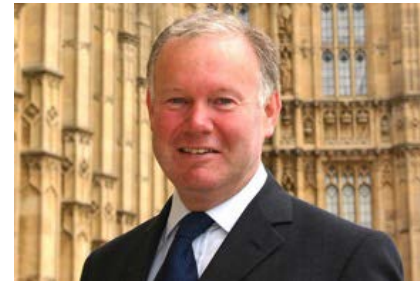
Former UK Energy Minister – Charles Hendry